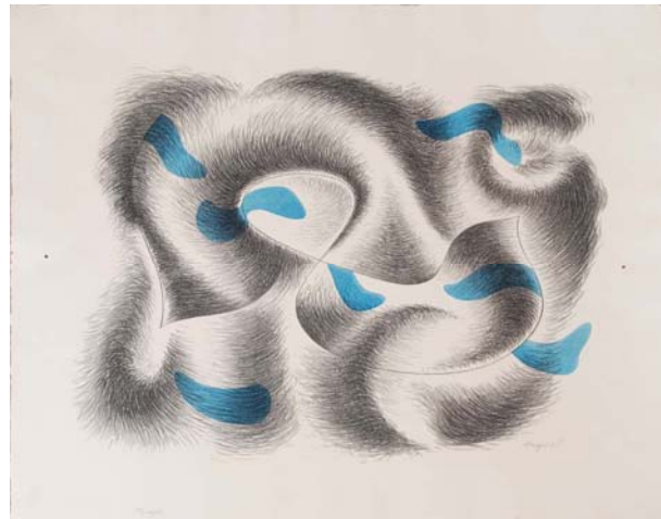
Seven Convolutions Lithograph, 1948

Peyton Wright's "Herbert Bayer (1900-1985): Fifty Years of Prints, 1930-1980" will mark the first and most comprehensive exhibition of Bayer's works on paper in the United States since 1982. The featured work spans Bayer's career, from a number of very rare