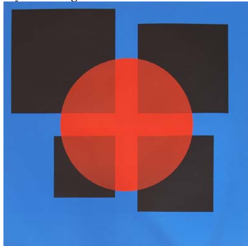
Segmented Circles Lithograph

After four years at the Bauhaus, Bayer was appointed the director of the new Bauhaus printing and advertising workshop in Dessau. In 1928, Bayer left the Bauhaus to become the Art Director of Vogue magazine's Berlin office, as well as the Director of the Dorland Studio in Berlin. In 1938, Bayer immigrated to the United States, where he lived in